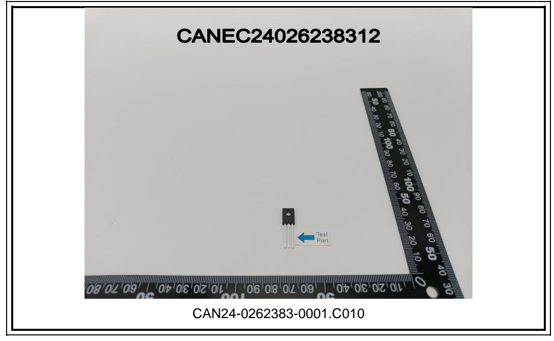
SGS authenticate the photo on original report only *** End of Report ***